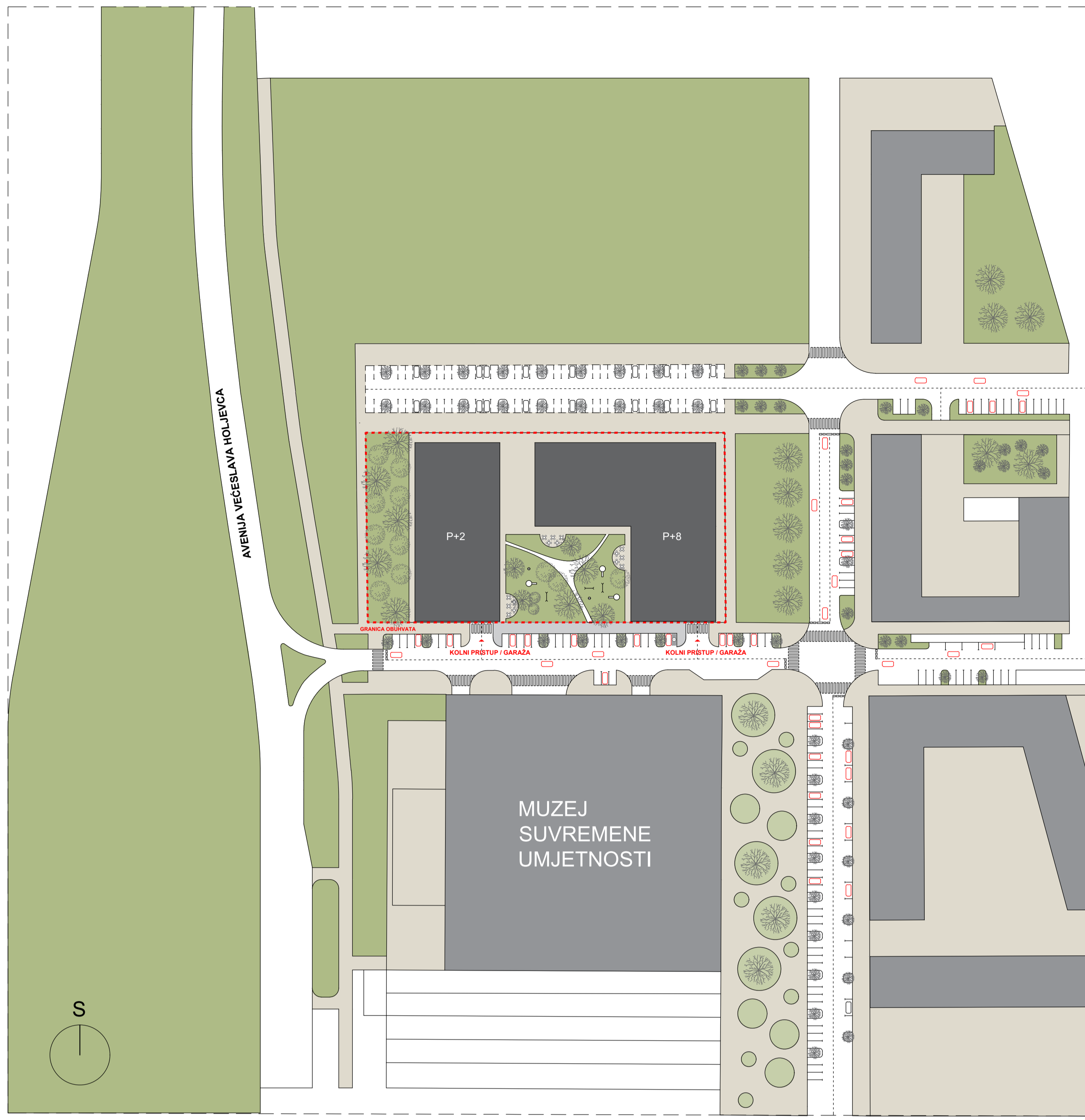
ŠIRA SITUACIJA M 1:1000