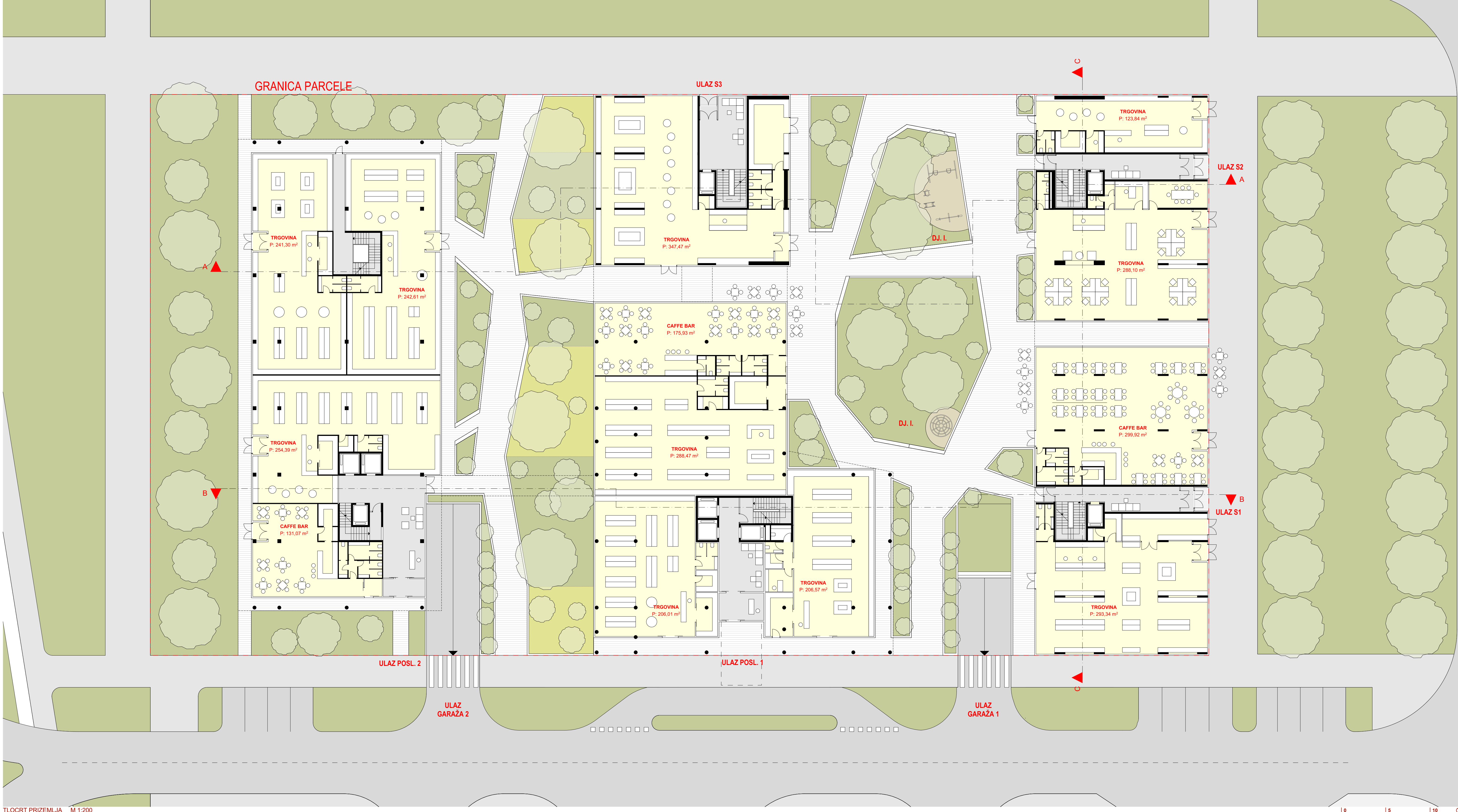
TLOCRT PRIZEMLJA M 1:200 10 15 10