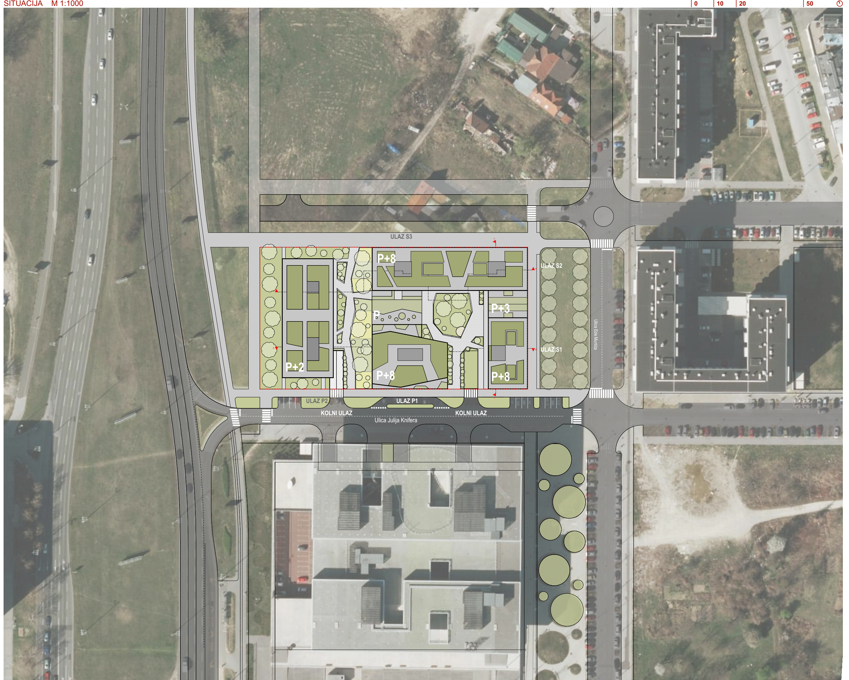
SITUACIJA M 1:1000